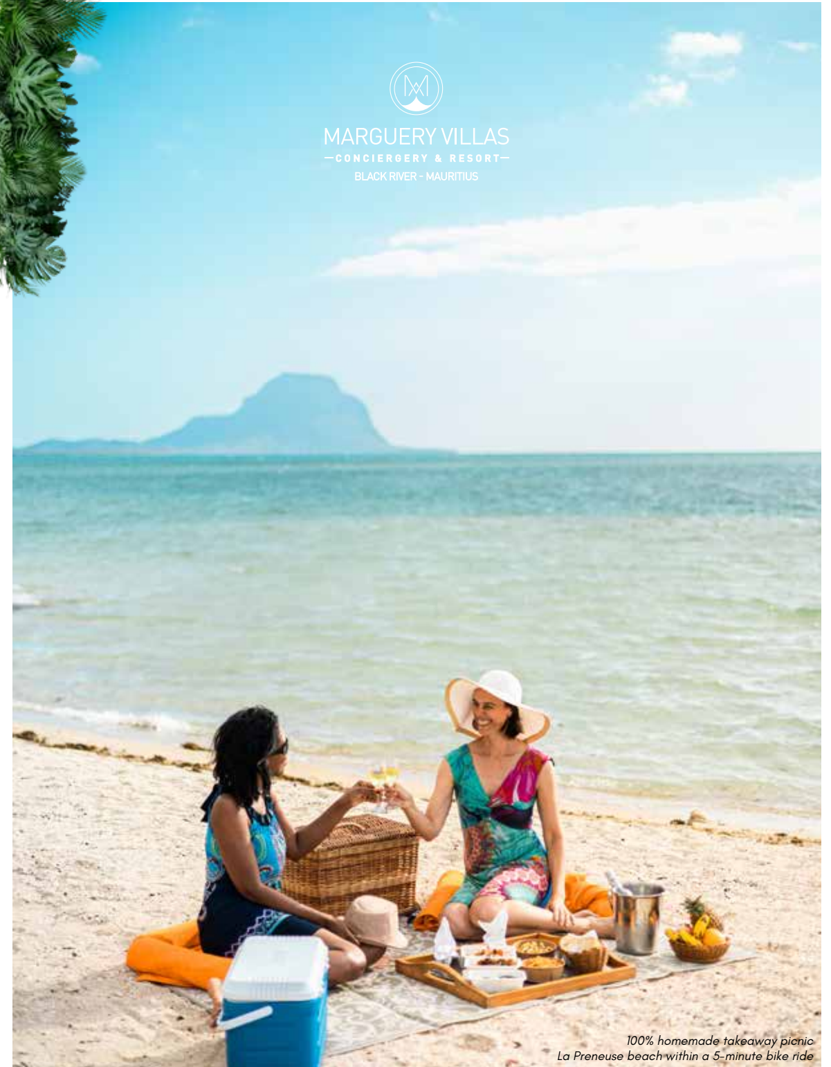
100% homemade takeaway picnic La Preneuse beach within a 5-minute bike ride